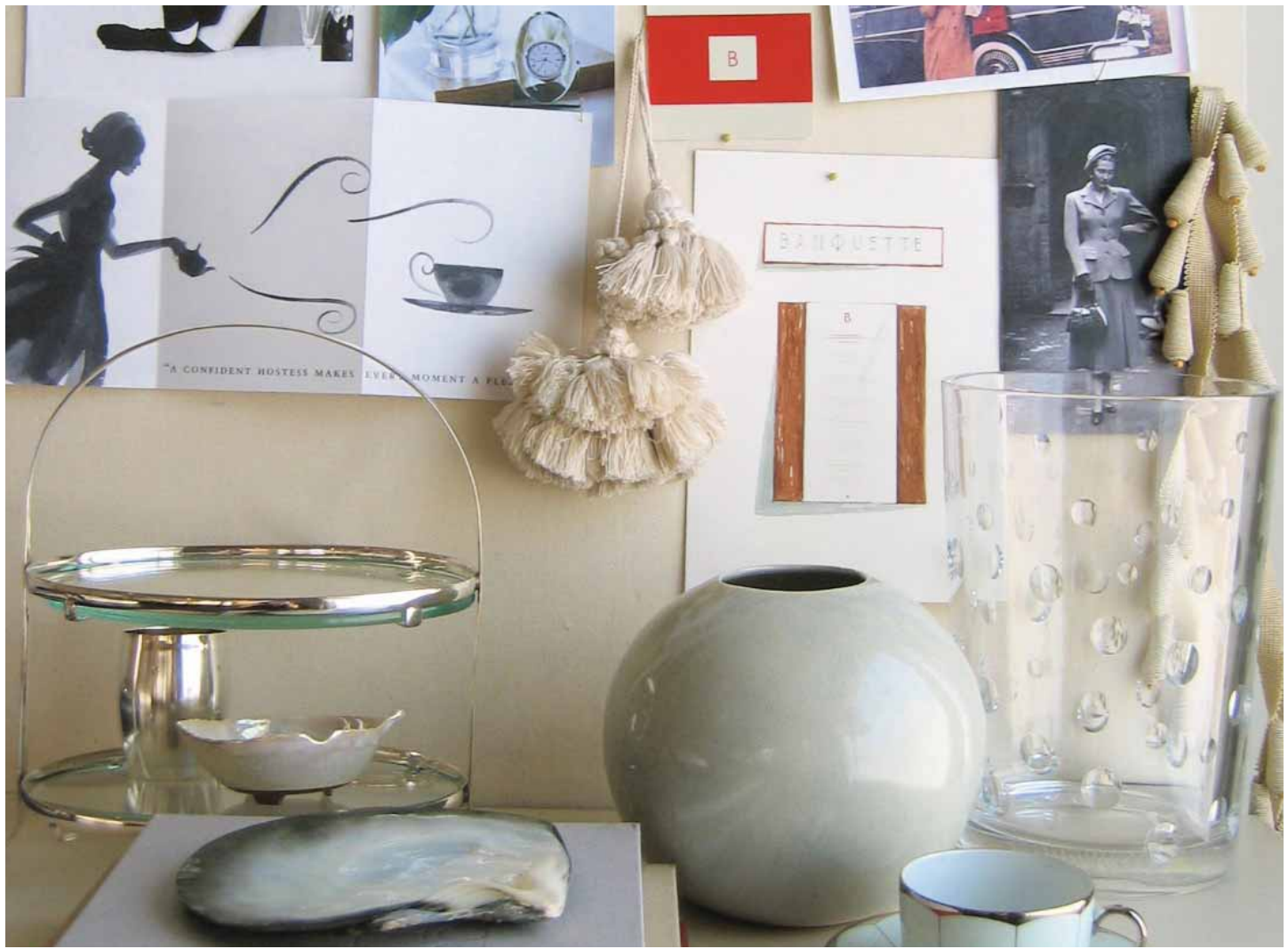
© 2008 Barbara Barry. All Rights Reserved.